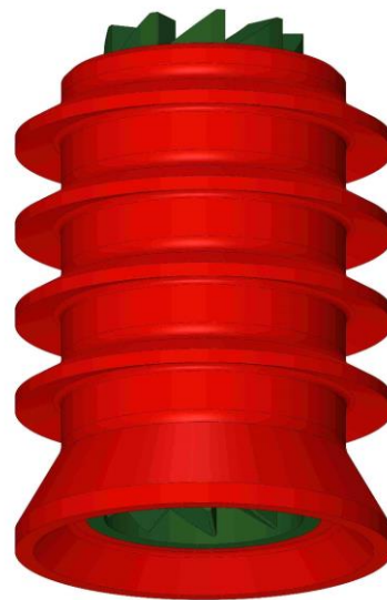
2. BOTTOM PLUG