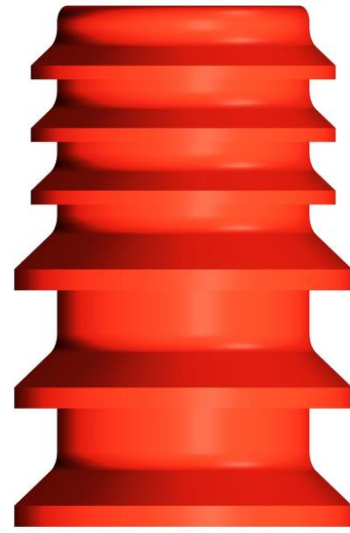
2. BOTTOM PLUG